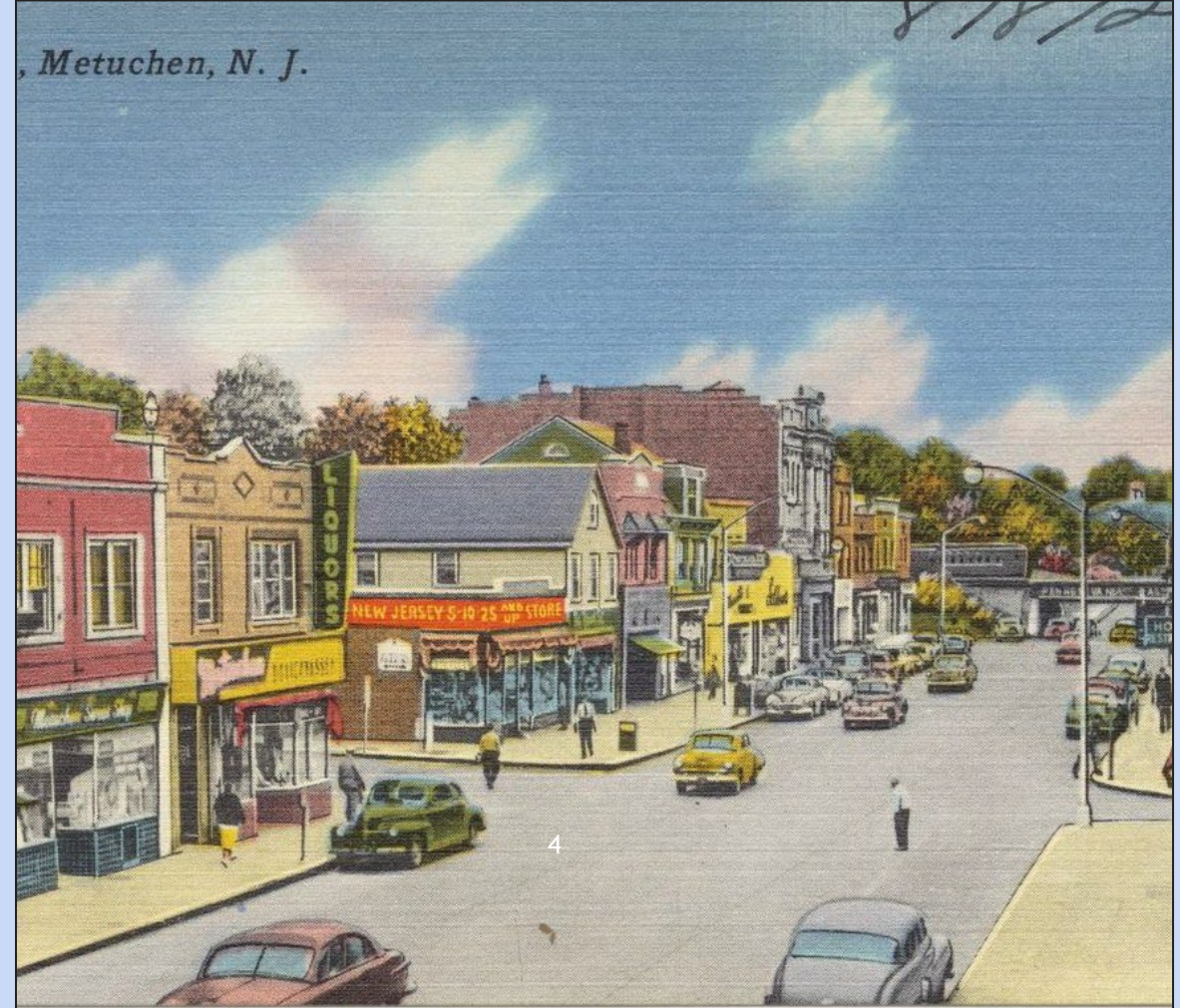
Main Street Metuchen, Digital Commonwealth