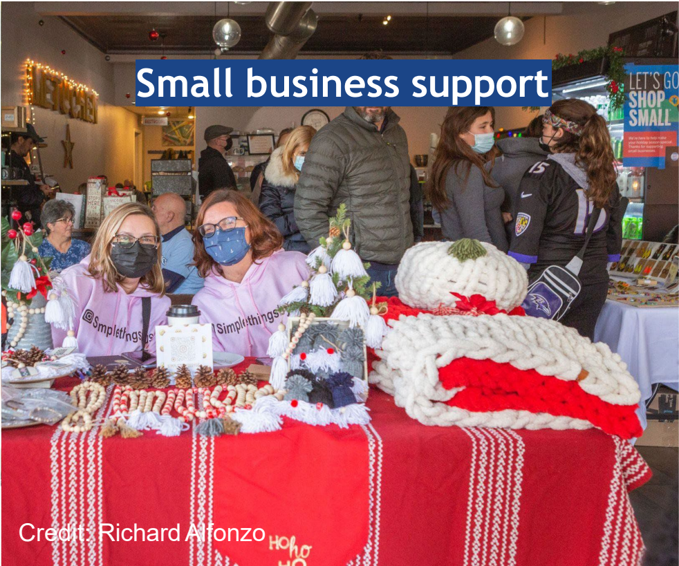
Small business support